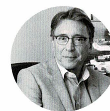
Q&A LUIZ DE BASTO Exterior designer

LOA: 295' GT: 2,925 Builder: Oceanco Naval architect: Oceanco/Azure Exterior designer: Luiz de Basto Interior designer: Nuvolari Lenard